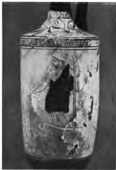
Fig. 57. Charon in his Skiff.

Acheron, River of Woe, and its branches, Co cy'tus, River of Wailing, and Phleg'e thon, River of Fire. The fourth river of Hades was the Styx, by which the gods swore their unbreakable oaths. Once across the Acheron the soul